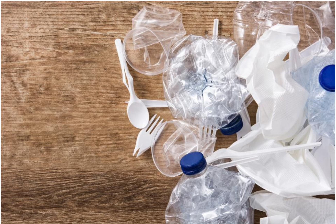
Disposable waste plastic on wooden background.

I write about the ocean, climate change, and the future of our planet.